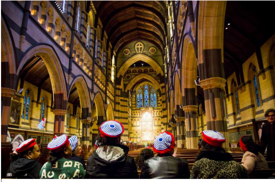
ST PAUL'S CATHEDRAL, MELBOURNE, 15 MAY 2015

others believed the Indonesian petition should have been ignored, firstly because Indonesia is not a Melanesian state, and secondly because it was tagged to an offer of $US20,000,000 for MSG capacity-development projects.