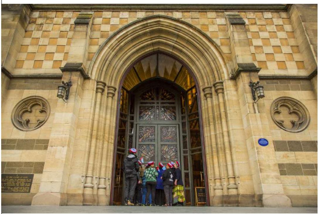
ST PAUL'S ANGLICAN CATHEDRAL, MELBOURNE, 15 MAY 2015

Prayer Vigil for West Papua's application to join the Melanesian Spearhead Group, 15 May 2015